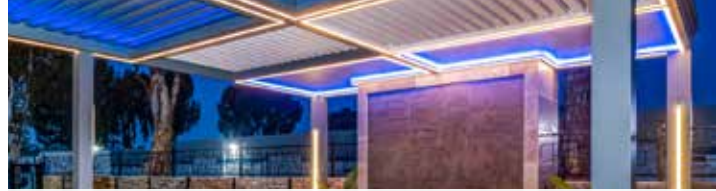
◆ SPACES FOR ENTERTAINING ◆