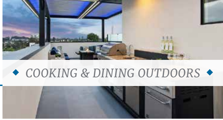
◆ COOKING & DINING OUTDOORS ◆